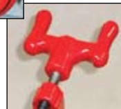
Carriage and Cutter Handles are Larger