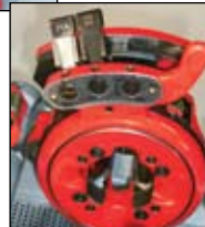
Notch-Type Auto Open Die Head — Oils thru the die head