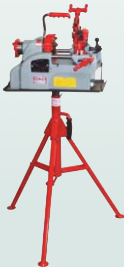
Model 7991 shown on optional 841 Stand