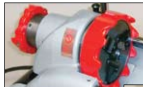
Front and Rear Chucks